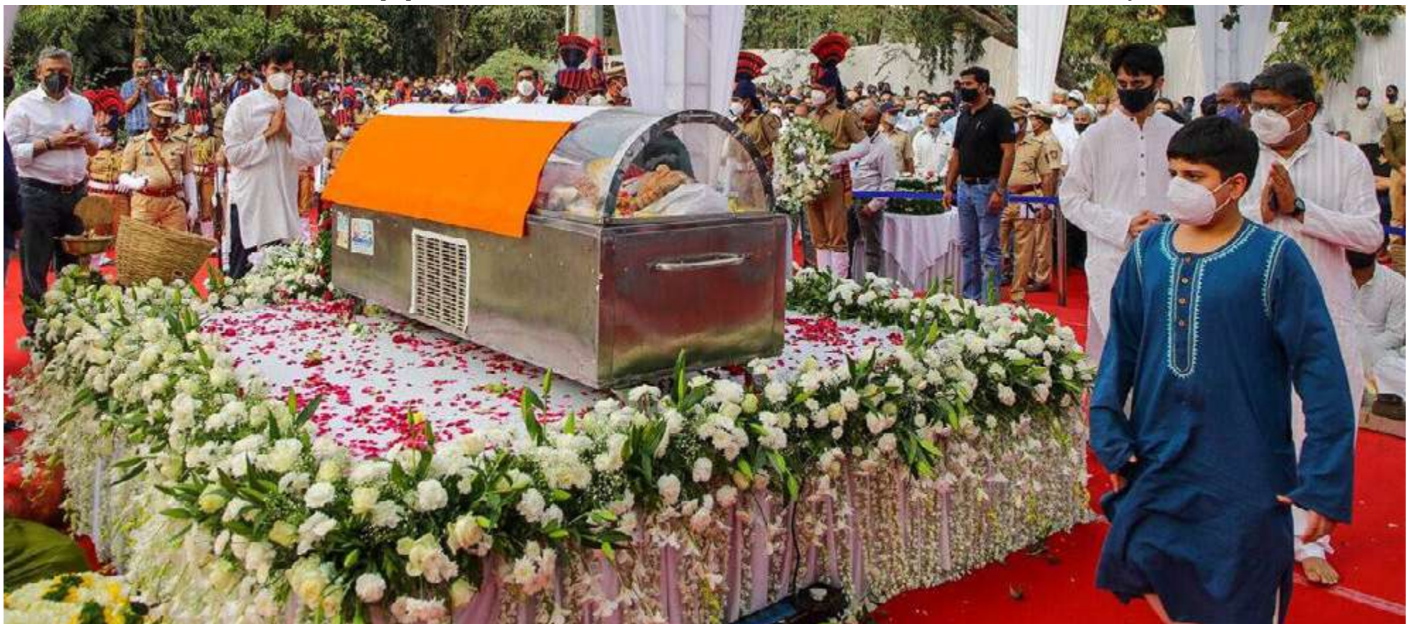
The mortal remains of businessman Rahul Bajaj were kept at the company's Akurdi facility for people to pay their respects.

Prime minister Narendra Modi said in a tweet that "Shri Rahul Bajaj Ji will be remembered for his noteworthy contributions to the world of commerce and industry. Beyond business, he was passionate about community service and was a great conversationalist. Pained by his demise. Condolences to his family and friends. Om Shanti".