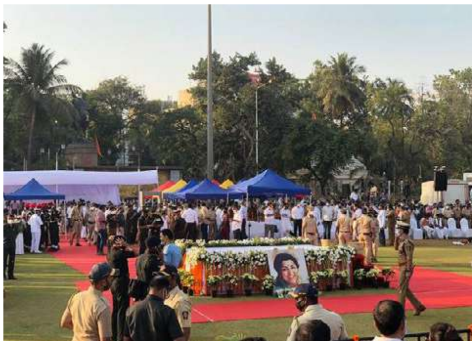
Lata Mangeshkar's last rites at Shivaji Park, Mumbai.

wanted to see a strong and developed India," he said.