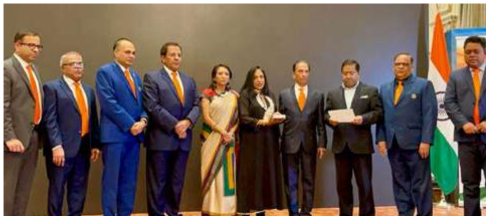
The FIA 2022 committee takes the oath of office.