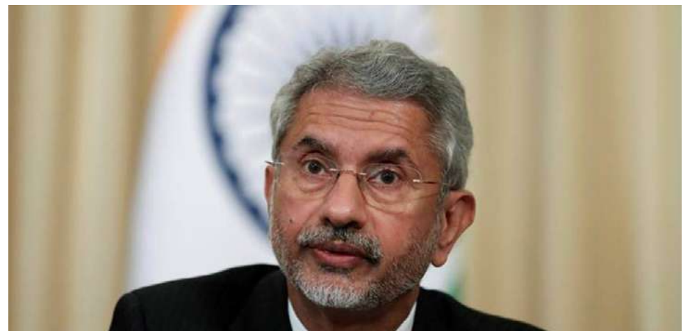
The telephonic conversation took place on Monday night, Jaishankar said.