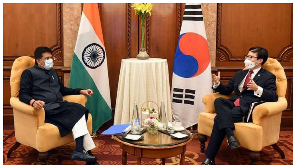
Union Commerce Minister Piyush Goyal with South Korean Trade Minister Yeo Han-koo