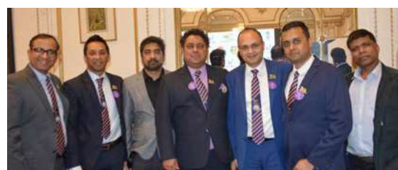
FIA committee members at the IWD event.