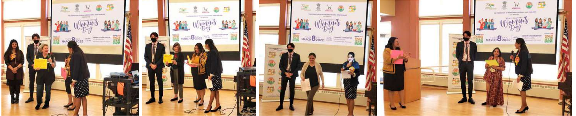
Honorees honored at the IWD event.