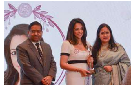
Hon. Dipti Dedhia honored at the event.