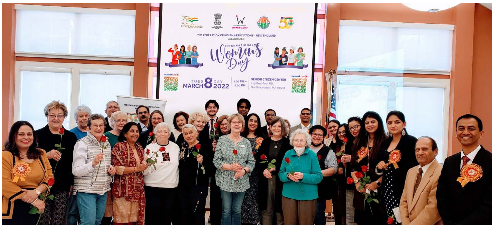
Federation of Indian Associations- New England celebrated International Women's Day at the Senior Center in Northborough, MA.