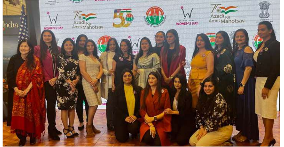
FIA committee with the Honorees