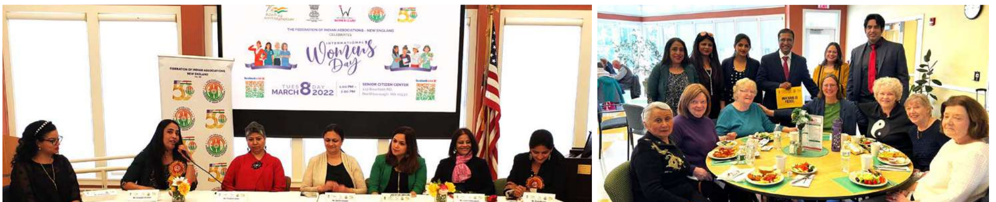
FIA New England committee members with the awardees at the event.